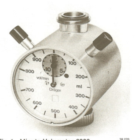
Fig. 1 Minute Volumeter 3000

Measurement range 1 turn of large hand 1 turn of small hand Necessary initial flow Max. permissible peak flow Flow resistance Heat stability Connections Air inlet (above) Air outlet (below) Weight (without heating) Dimensions