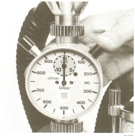
Fig. 4 Release of indicator hand for tidal volume