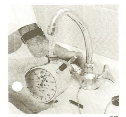
Fig. 8 Flushing out Volumeter

fore. It does not need to be dried. Sterilize in an autoclave set to a glove programme at 120°C.