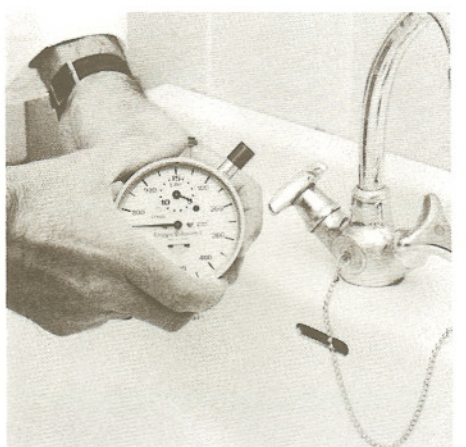
Fig. 9 Shaking out remaining water