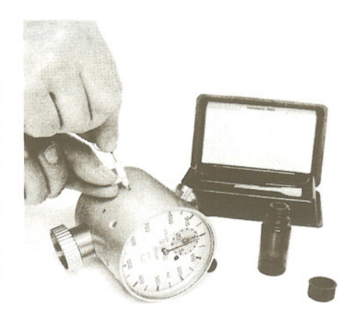
Fig. 11 Lubrication of the bearings