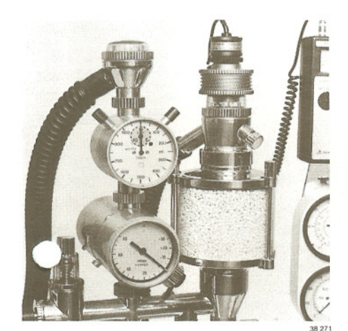
Fig. 2 Minute Volumeter 3000 in circle system of anaesthetic machine

To stop the indicator hand after a certain number of respiratory cycles, the right button is depressed half way. To restart the Volumeter, the same button is completely depressed.