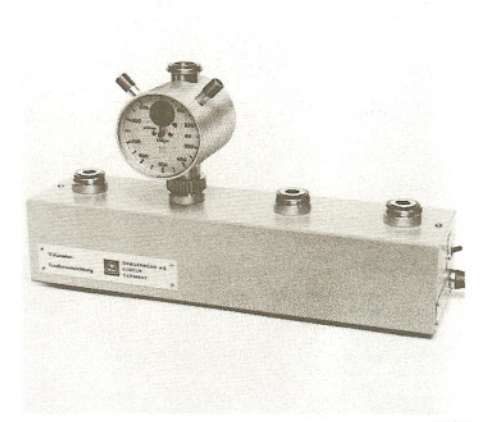
Fig. 10 Dräger Volumeter-Dryer 2 M 14850