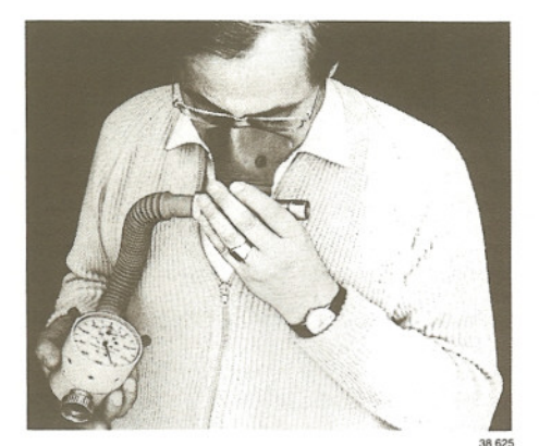
Fig. 6 Measuring the vital capacity using a face piece

During postoperative recovery, the minute volume of a patient with an indwelling endotracheal tube can be determined using the same special equipment without further expenditure.