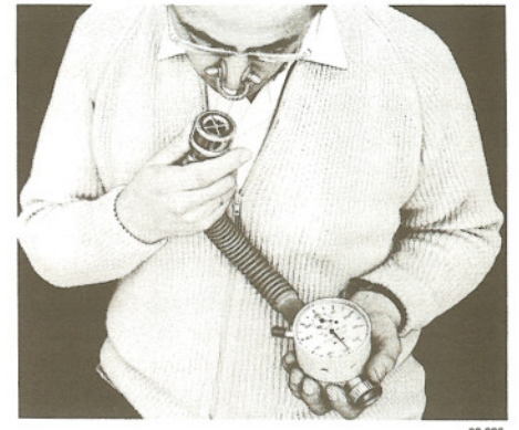
Fig. 7 Measuring the vital capacity using a mouth piece